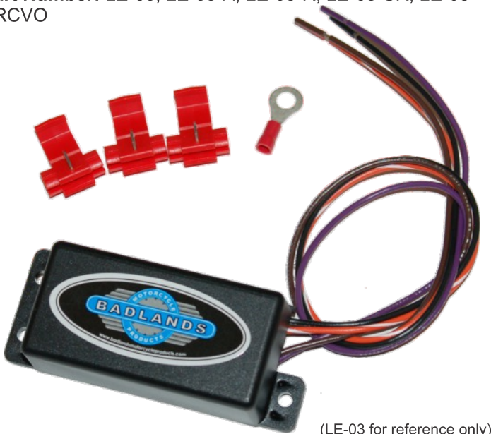
(LE-03 for reference only)

Part Number: LE-03, LE-03-A, LE-03-R, LE-03-SR, LE-03-SRCVO